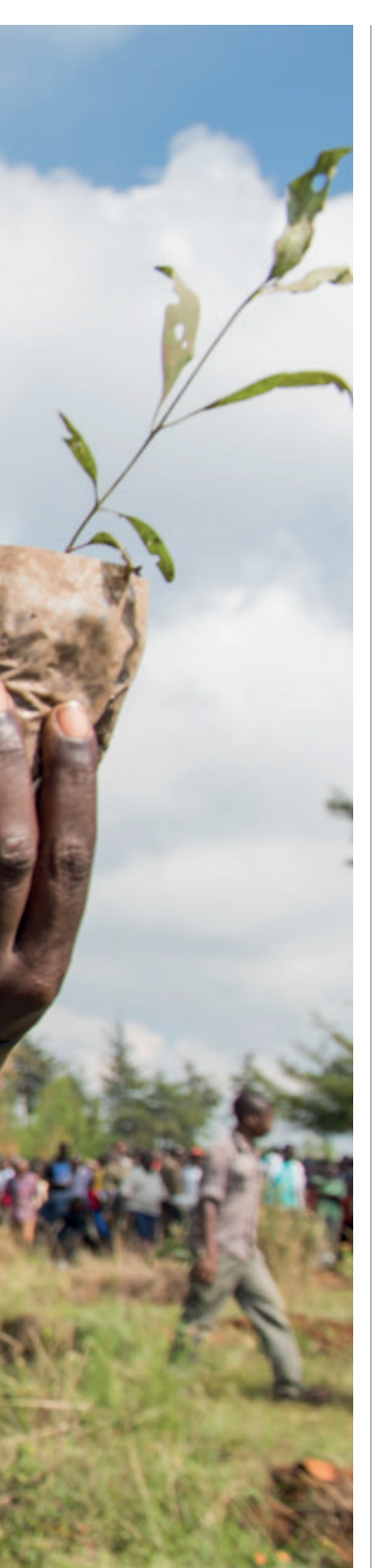
A woman participates in the Rwandan monthly day of community service.

More than two decades after genocide shattered the country, Rwanda has established itself as an S&T model for Least Developed Countries.